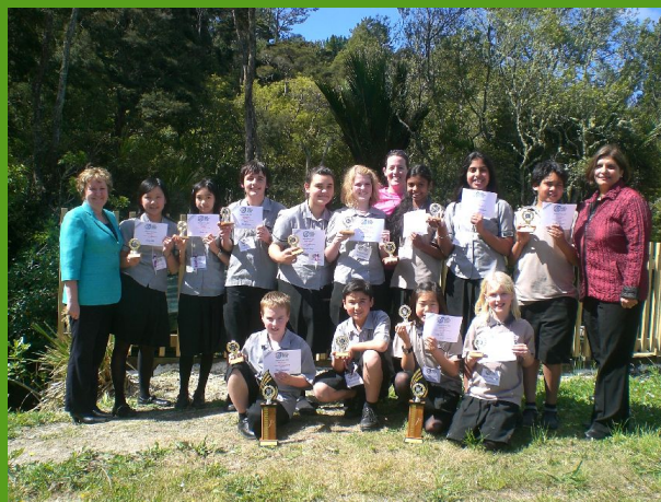
The proud teams and coaches with their trophies after the competition.

The teams now need to raise $75,000 to travel to Wisconsin for the International finals in June 2010. If you have any fundraising suggestions we would love to hear from you.