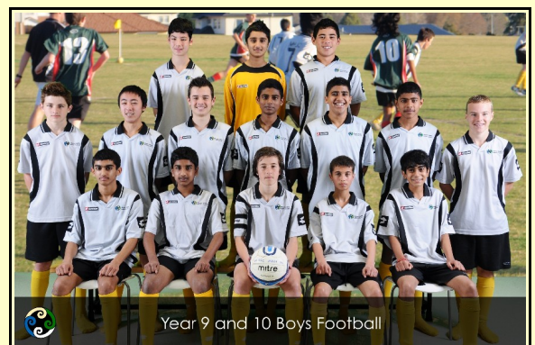
Year 9 and 10 Boys Football

The boys remained unbeaten throughout the season despite some challenging games. Congratulations on another great year.