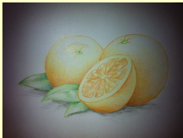
Tei Kim: Colour pencil