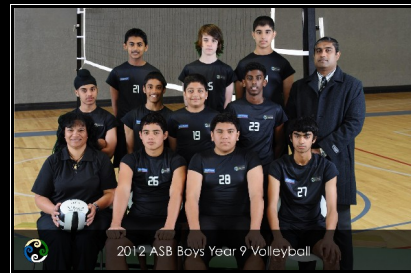
2012 ASB Boys Year 9 Volleyball

Our Year 9 and 10 Boys and Girls Volleyball teams both experienced success in their respective divisions this year with the boys winning their division and the girls placing second in theirs.