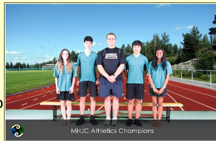
MHJC Athletics Champions

The MHJC athletics day held at Lloyd Elsmore Park was again a big success. Congratulations to our Junior Champions