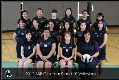
2012 ASB Girls Year 9 and 10 Volleyball

Our Year 9 and 10 Boys and Girls Volleyball teams both experienced success in their respective divisions this year with the boys winning their division and the girls placing second in theirs.