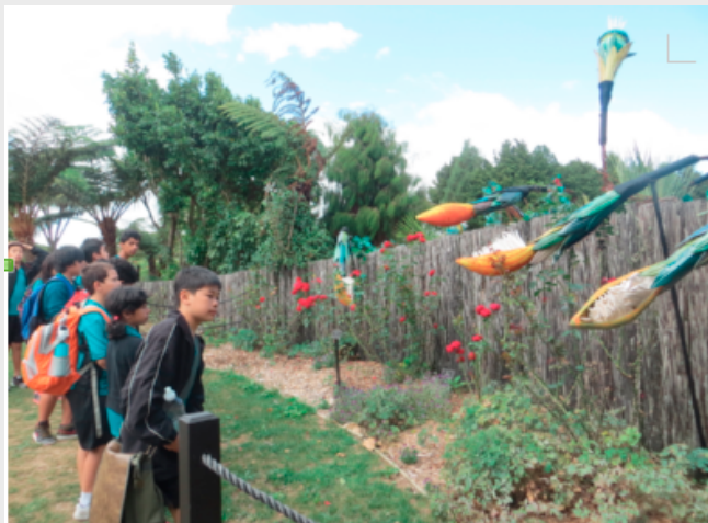
Pictured: Coast students exploring sculptures at the Botanical Gardens.