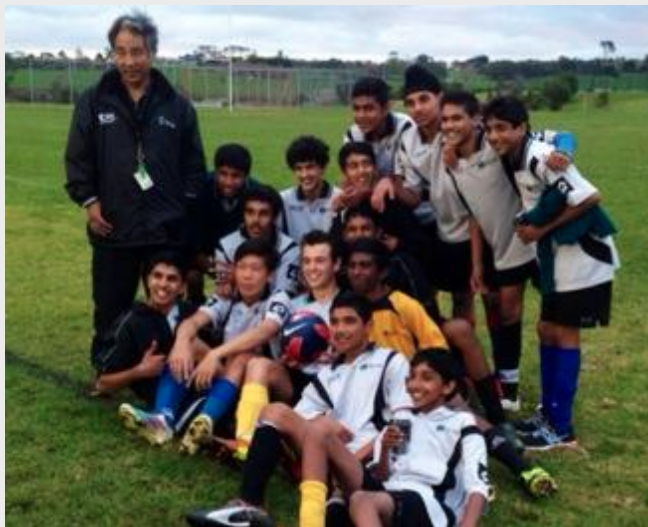
Pictured: Members of MHJC's Senior Football Team.