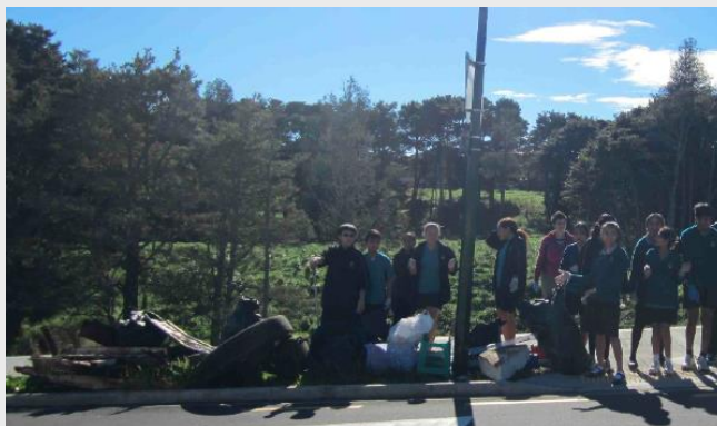
MHJC WaiCare Group Clean Up Local Reserves