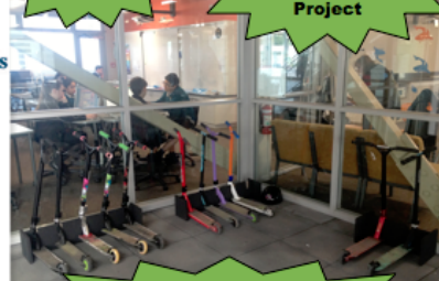
Guest Speakers, Red Cross Refugee Services