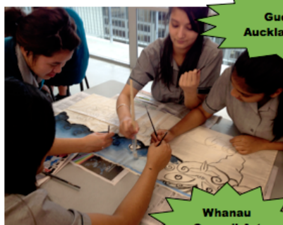
Guest Speaker, Auckland City Mission