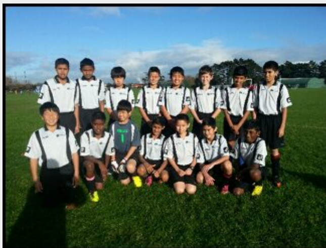
Pictured: Members of MHJC's Yr 7 Eastern Zone Football Team.

This week we celebrate Māori Language Week at MHJC. In 2013, we will be celebrating Māori language and culture in many ways, including a Language Perfect '2013 Māori Language Competition'. This competition is