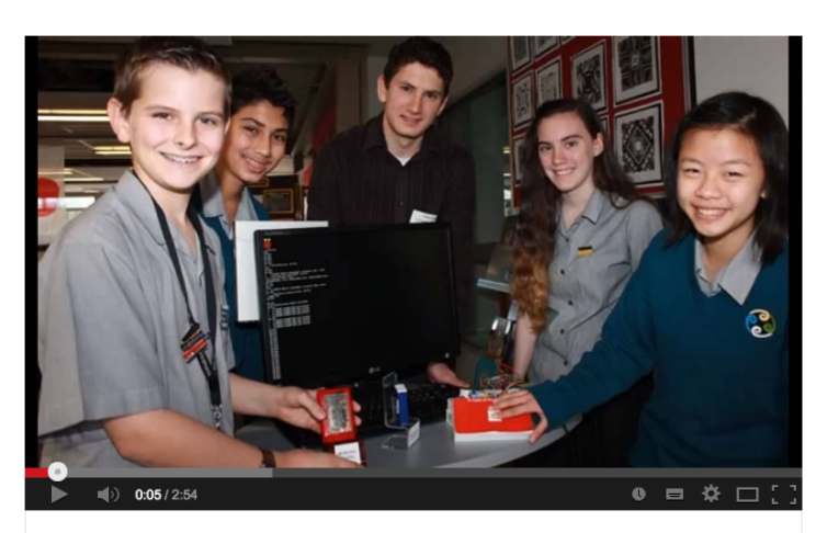
Project Alert - Mission Heights Junior College