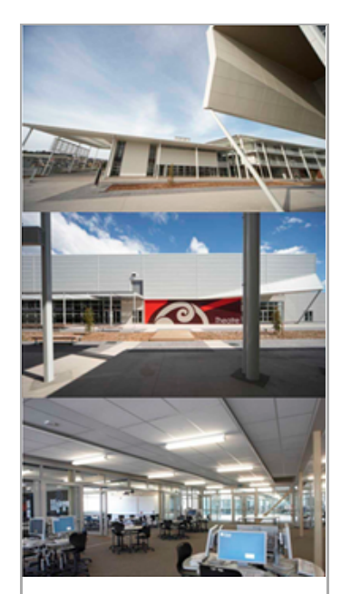
Whanau Organisation for 2014

Stationery lists for 2014 have been emailed to all families and are also published on our MHJC website Mission Heights Online . Students are required to wear the correct school and PE uniform, and have their school stationery on their first day of the new school year please.