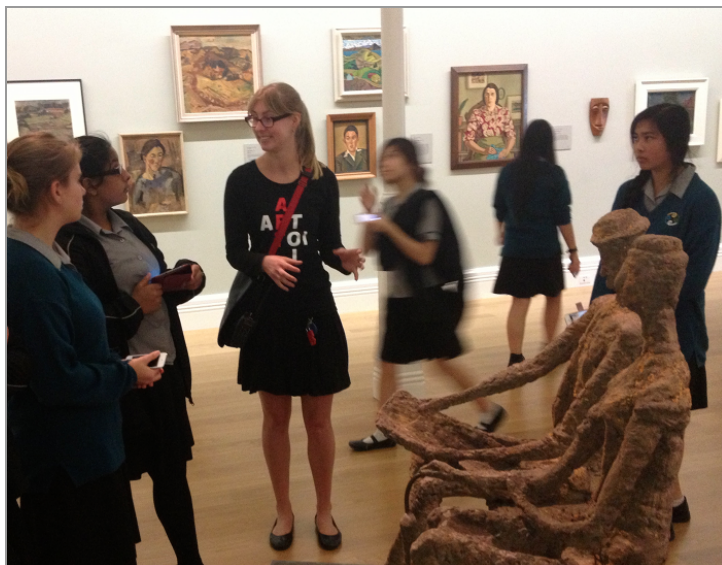
Pictured: Art Gallery guides discussing the works with students.