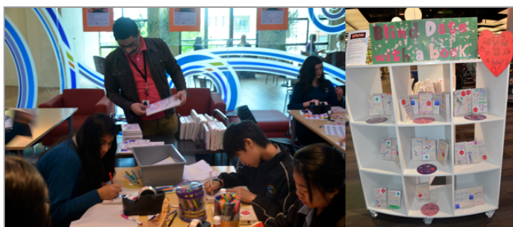
Pictured: Water Whanau students preparing their 'Blind Date with a Book' display at the Botany Library.