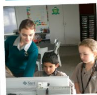
* Leadership through Service